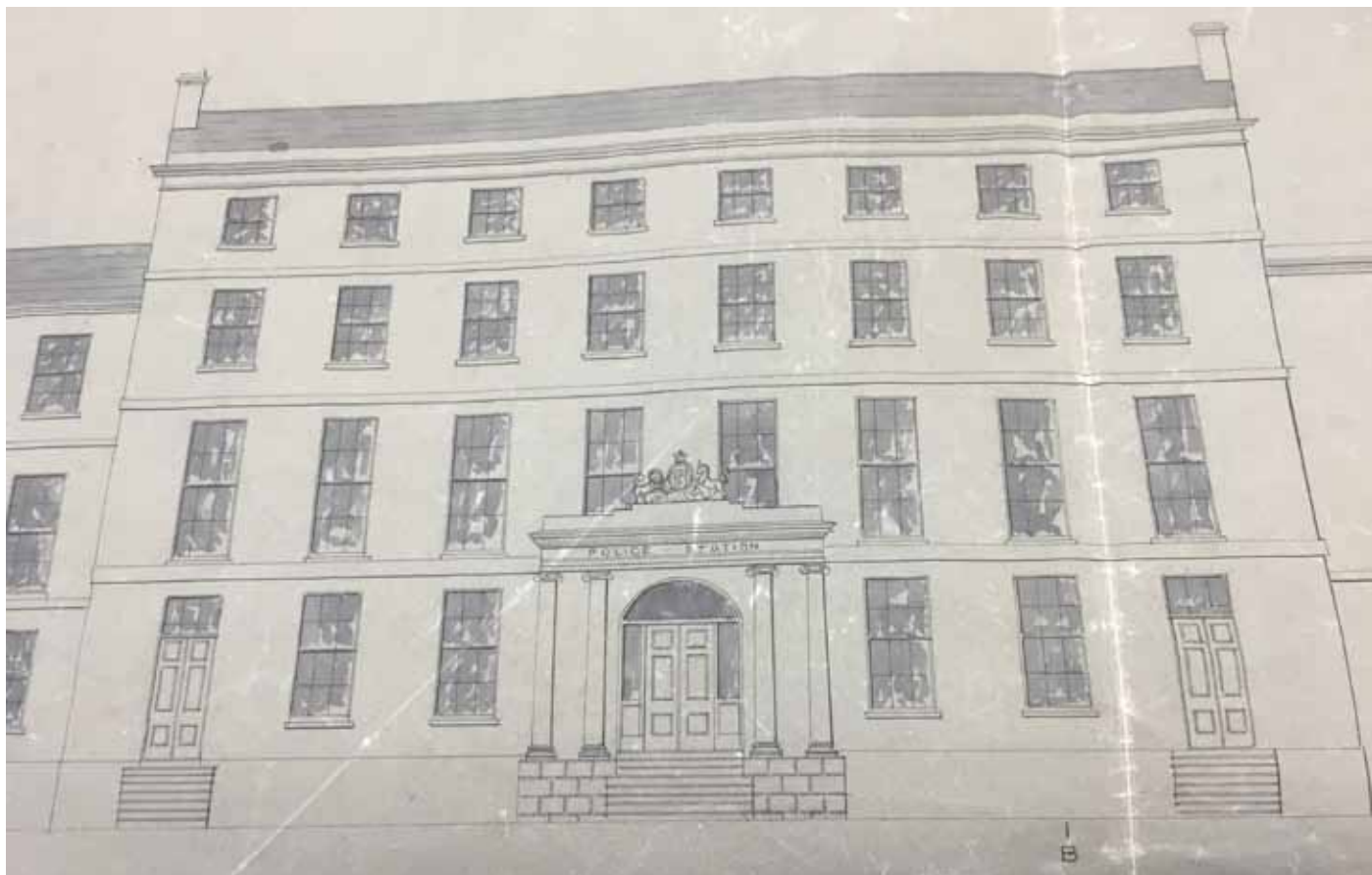
Part of James Medland's design for Cheltenham Central Police Station, 1857. Later renamed John Dower House and now converted into flats (GA/C/AA/B1)

The site had extensive accommodation for all police ranks. The higher an officer's ranking, the more extensive and private his accommodation. The deputy chief constable enjoyed a 14 roomed apartment across three floors while constables were accommodated in third-floor dormitories. By the 1860s, 59 police officers were living on the site. The ground floor included a charge room and constables' day room. The plan suggests the station was not designed to facilitate crime reporting by members of the public. Instead, it was planned for certain procedural functions pertaining to the detention and interrogation of suspects and critically, by accommodating officers, their rapid deployment and organisational discipline. The court accommodation on the first floor with the offices of the chief constable and deputy chief constable no doubt perpetuated this. There were separate male and female cells in the basement where a female attendant looked after the female prisoners. Outside, there was a large parade