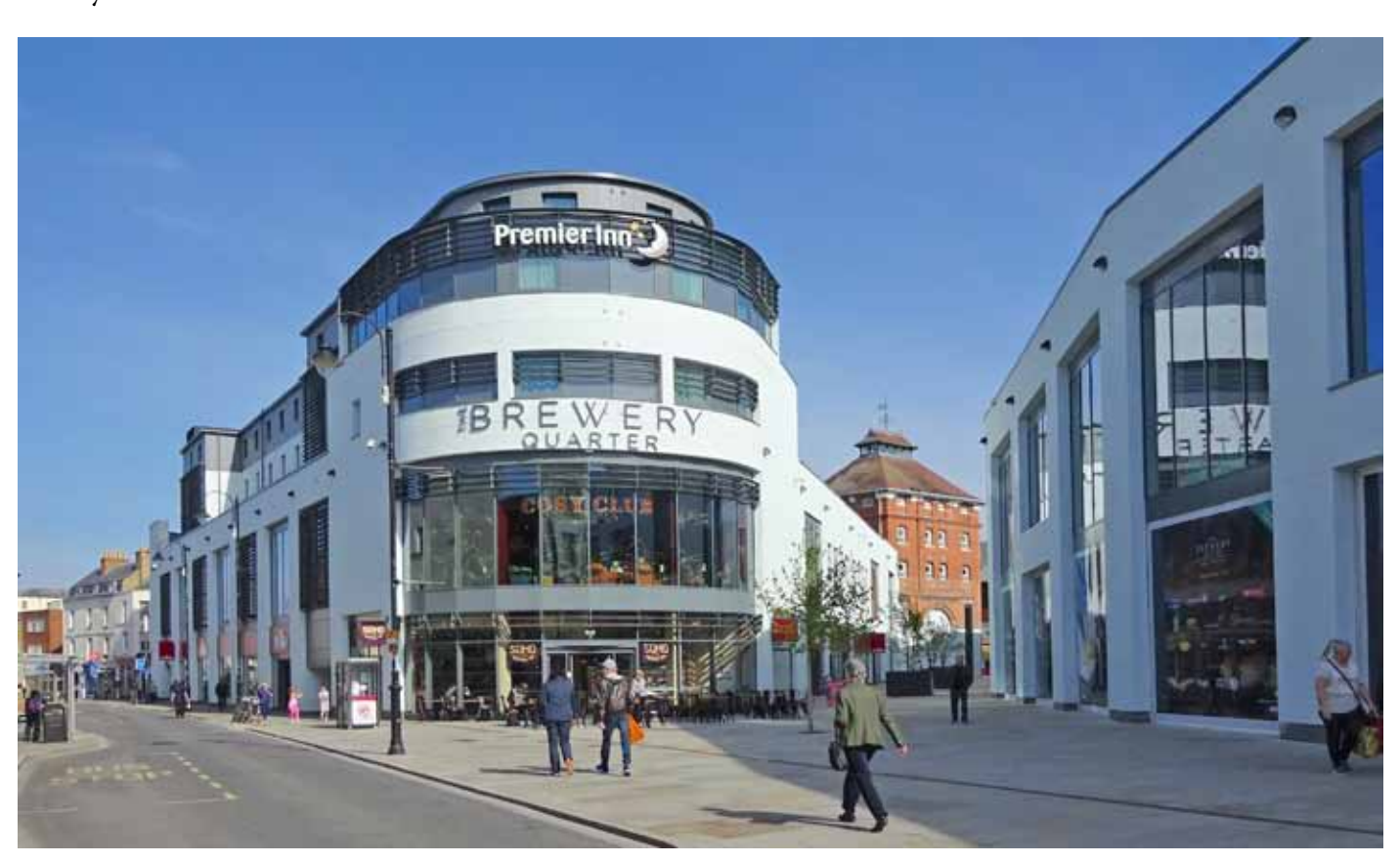
The Brewery Centre, Cheltenham High Street (see below.pages 6-7)

Well, that wasn't quite the way we all expected the first half of 2020 to go, was it? We'd rather hoped to be concentrating on writing up past history, but