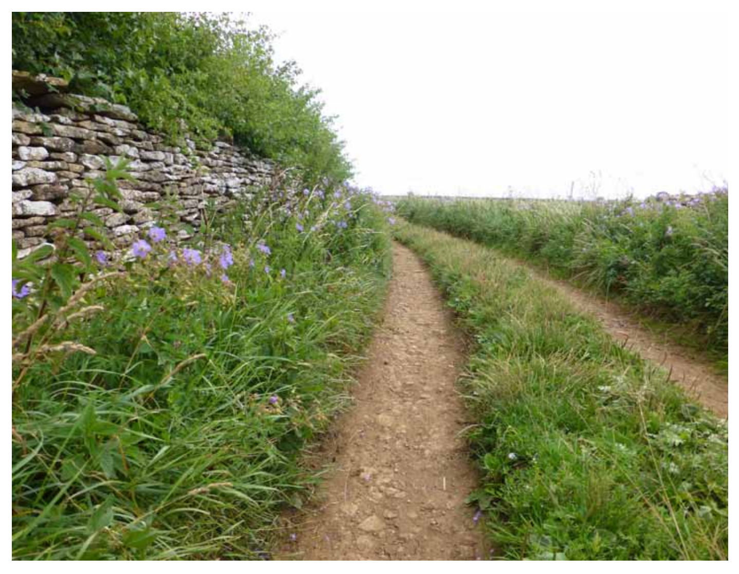
Slait Lane West Littleton: an ancient trackway used as a modern parish boundary

We all think we know an area because we drive through it, but to get to understand a place, to enjoy and appreciate it, the first essential is to turn off the highway, meander down the lane and park at the village green by what used to be the phone box. Then go for a walk, with a map. So, on my way to