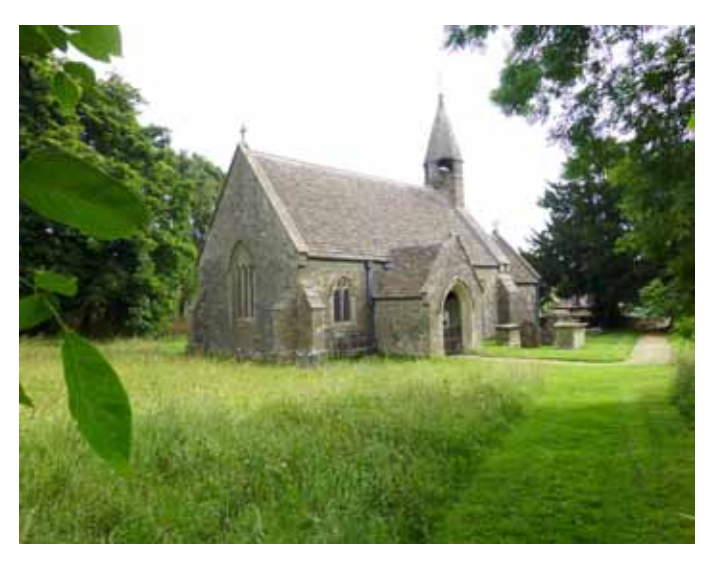
West Littleton's church of St James was mostly rebuilt 1855-56, although the mid-thirteenth bellcote was retained

You've all been to West Littleton, just about – not the village, but the parish – although you were probably not aware of it. Down the A46 towards Bath, and just past the entrance to Dyrham, there you are, driving along the parish boundary, with West Littleton on your left. It is one of a group of three parishes that sit together, with intertwined histories, that are to be included in our Vol. 14. Acton Turville is another (you may not have been there so often), and Tormarton is the third (everyone could find their way there, and does – M4 J18 if you need a hint).