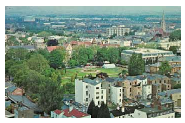
View from the Eagle Star Tower 1978

opposition at a public inquiry, it was dropped and a new plan drawn up by consultants. The revised plan produced in 1971 pleased no-one. It threatened too many buildings to satisfy the 'implacable conservationists' without allowing the 'progressors' a free hand to develop industry and adapt Regency buildings willy nilly for offices. By this time the tide was turning in the direction of the conservationists, as demonstrated two years later by the designation of almost the whole of the historic centre of Cheltenham as a conservation area under the provisions of the 1971 Town and Country Planning Act.